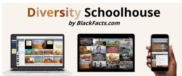
Black History Delivered on ANY Device

Diversity Schoolhouse is a natural extension of BlackFacts’ mission that empowers K-12 educators with a unique ed-tech platform. With over 1,500 original videos, AI-driven tools, and semester-long courses, Diversity Schoolhouse enables teachers to teach Black History and Ethnic Studies from any internet-connected device. Currently in almost 100 schools across 14 states, including as a single-source vendor for New York City public schools, we deliver a 21 st Century educational solution for our 21 st Century students.