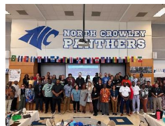
Professional Development Included